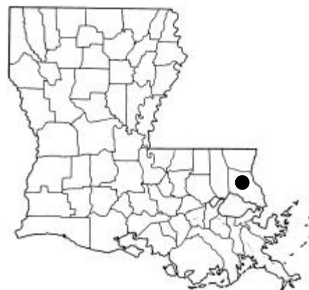
Fig. 3. Parish records by this author.