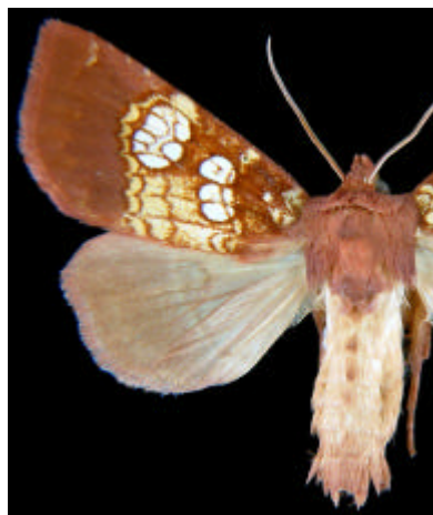
Fig. 1. Papaipema appassionata