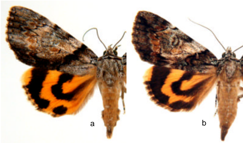
Fig. 1. a. Catocala lincolnana male, b. Catocala texarkana female.

The rarely encountered noctuid moth Catocala lincolnana Brower (Fig. 1a) has been captured in two Louisiana parishes (Fig. 2). The little known species Catocala texarkana Brower (Fig. 1b) is recorded for Louisiana by a series of several dozen specimens taken at ultraviolet light in northwest Louisiana (Fig.2) taken