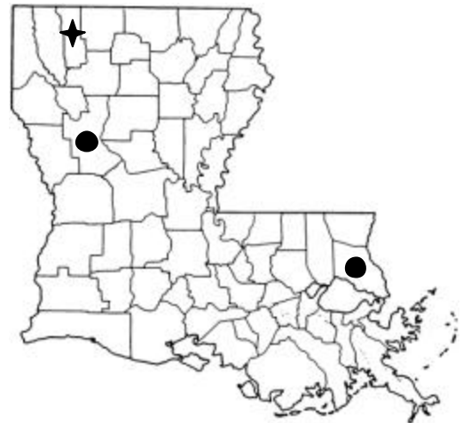
Fig. 2. Parish localities by this author lincolnana ●, texarkana ★.