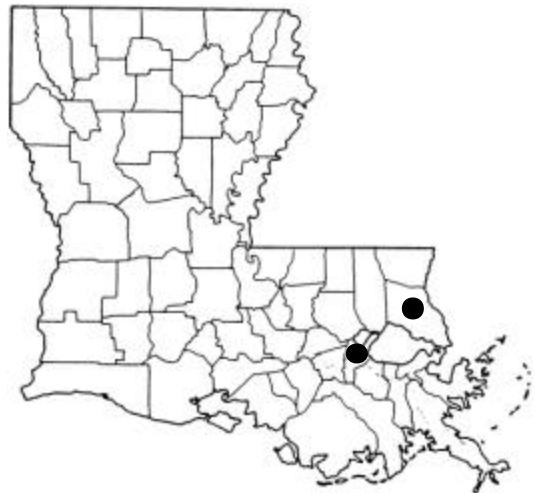
Fig. 3. Parish records.

In Louisiana, perblanda is single brooded, flight peaking the first week of April (Fig. 2). In Louisiana, perblanda has been taken in only two southeastern parishes (Fig.3).